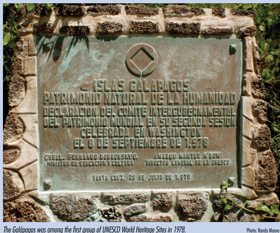
The Galápagos was among the first group of UNESCO World Heritage Sites in 1978.

n 1978, the Galápagos Islands became one of the first four natural sites to be made a United Nations Educational, Scientific, and Cultural Organization (UNESCO) World Heritage Site. UNESCO considers it in the interest of the international community to preserve sites that meet strict criteria and are of importance to the world as World Heritage Sites. The Galápagos fulfills the criterion "to contain superlative natural phenomena or areas of exceptional natural beauty and aesthetic importance." This designation had important implications for the conservation of the Galápagos, for UNESCO World Heritage Sites are watched by the world.