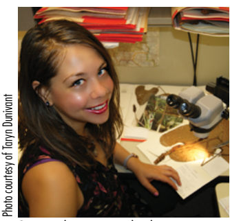
Species descriptions, dead to extinct